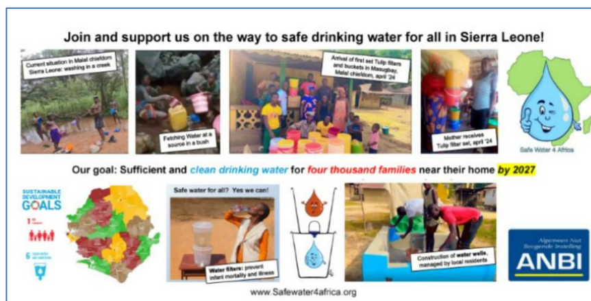
Photo: Our One-page-plan as shown at the international Outing.